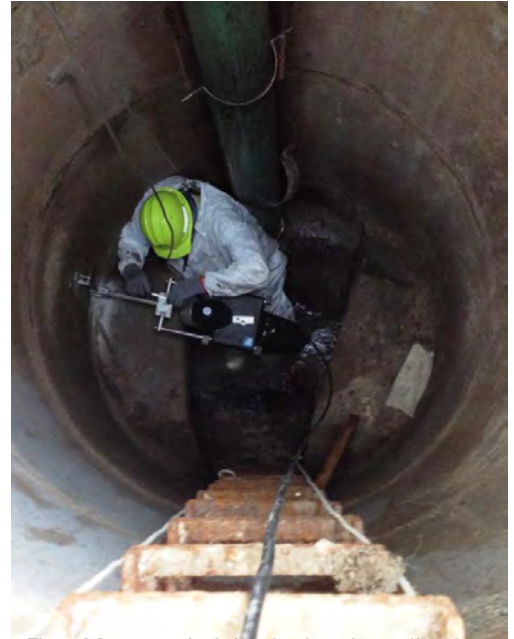
Flow Meter technician in the pipe adjusting the LaserFlow

It was decided the slope setting would be changed. After determining the slope of the pipe from a 12 foot rise over a 150 foot run = 8% slope. After a few program adjustments, the sensor worked flawlessly.