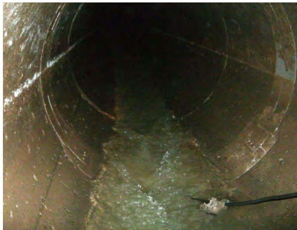
View of flow inside the pipe

This site, in a sanitary sewer, had two options for flow monitoring applications. The first application was in front of an overflow bypass gate where standard area velocity flow monitoring technologies were installed and working, but only intermittently. When the gate closed, the water surcharged the pipe until it overflowed into the bypass weir. The AV sensor was no longer able to read the bypass flow because the water at the bottom of the channel was no longer flowing. Another challenge was with the pipe joints creating turbulence.